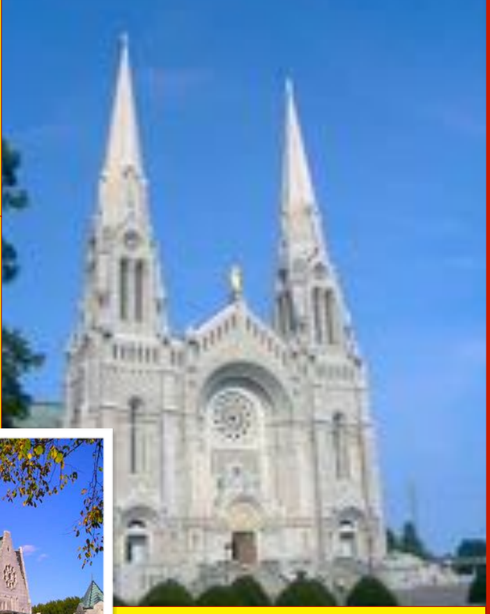
Notre Dame du Cap de Madeline