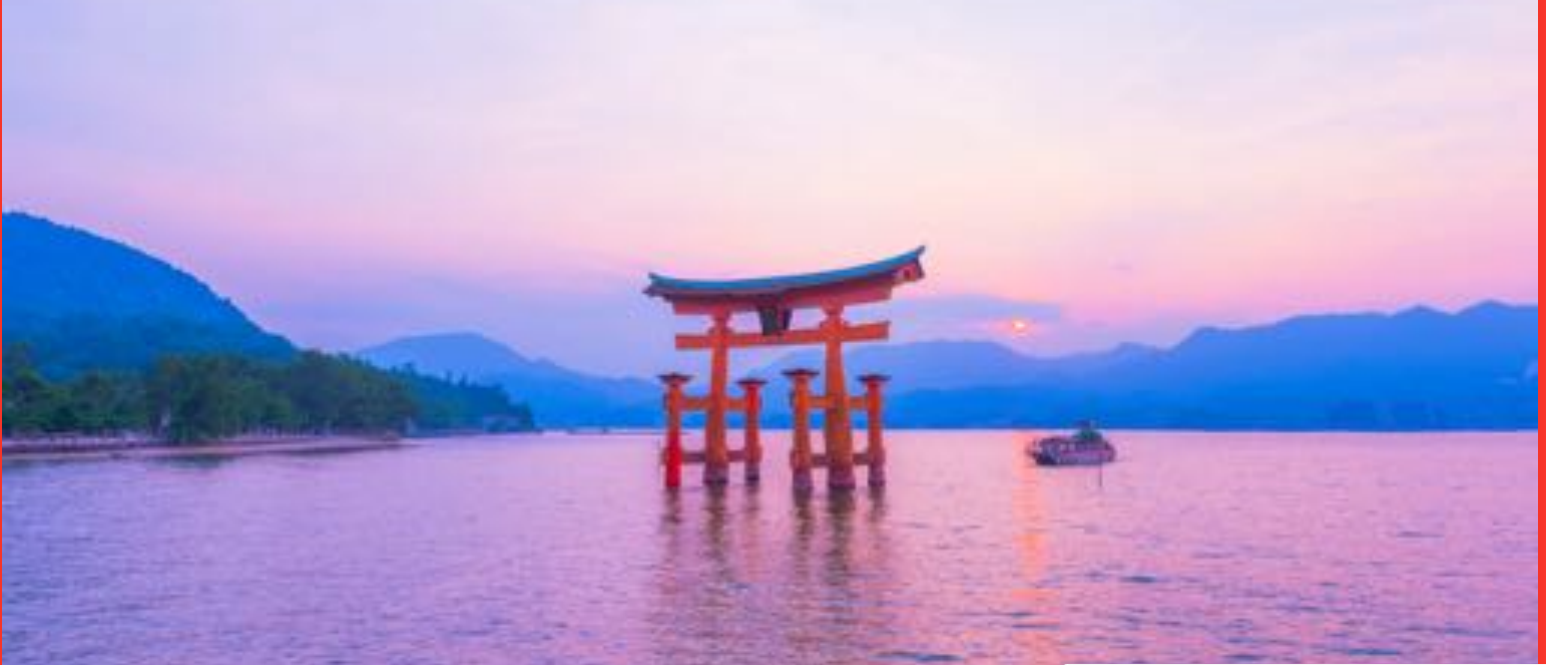
Hiroshima: Courtesy of Japan Travel Adventure Club