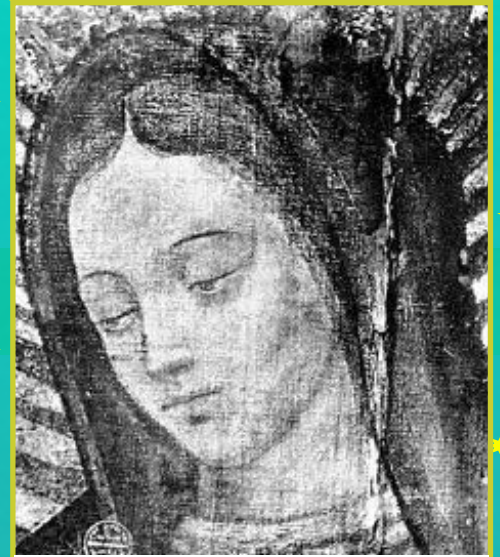
Close-up of Our Lady of Guadalupe