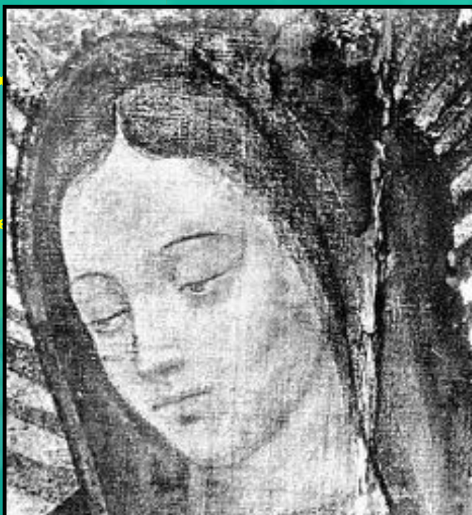
Close-up of Our Lady of Guadalupe